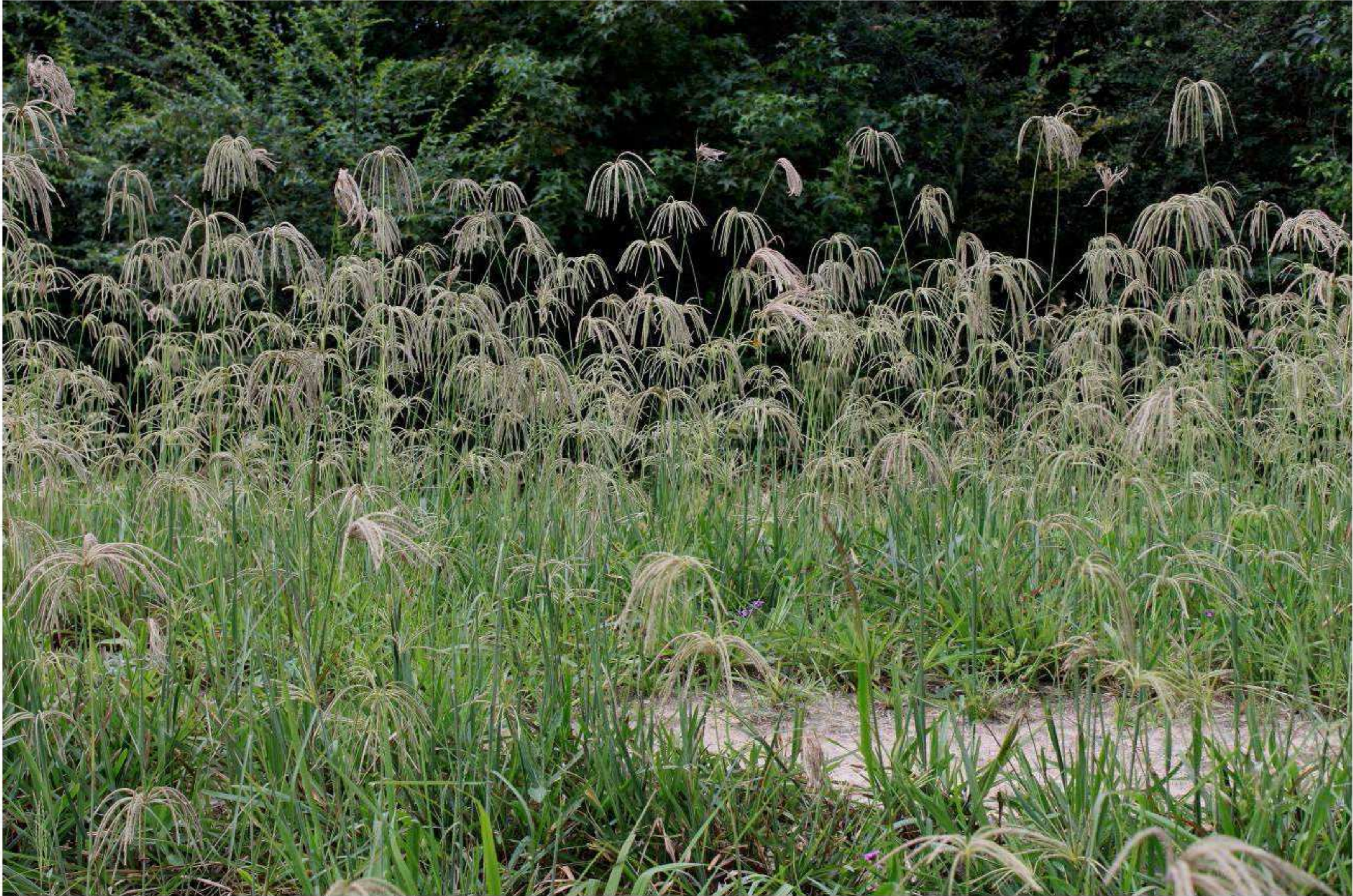
Figure 3. Eustachys distichophylla (Poaceae).